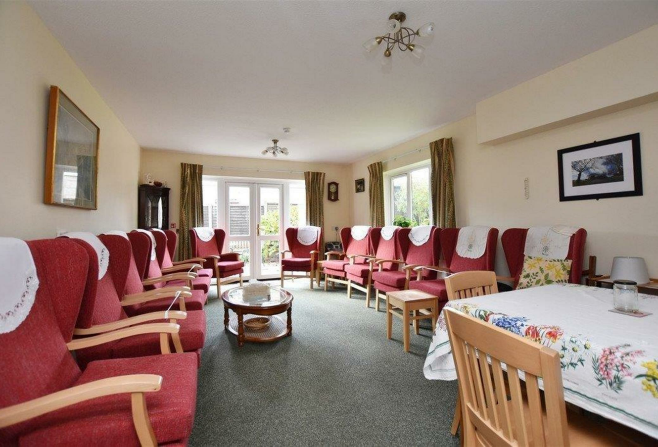
Council Tax Band - C